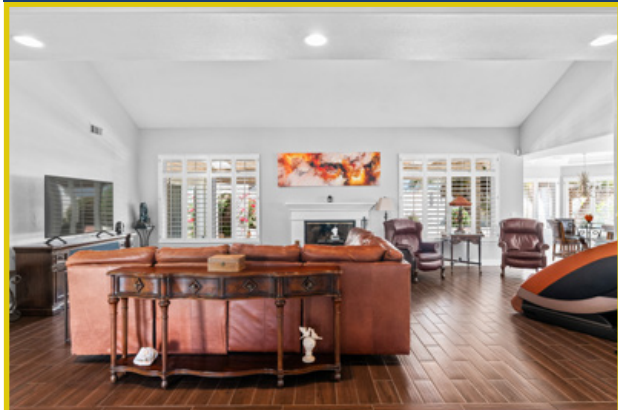
Spacious Living Room w/Fireplace